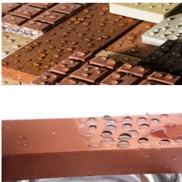
Figure 5. How to remove dandruff from stones and bricks