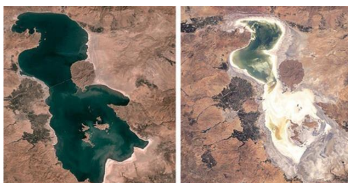
Figure 1. Urmia Lake