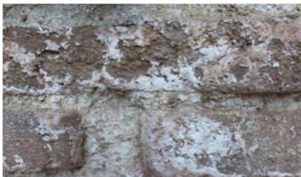
Figure 4. Dandruff formation and its mixture with lime and clay

The first way is to use salt-free sand and cement and to use stones in a dry and mechanical manner. That is, to pin and screw the stone to the building surface. The second method is to use washed sand with less salt. Some cities in Iran have sweet soil. In fact, no matter how deep we dig, we will yet reach sweet soil. These types of soils contain the best sand and cement for facade construction. After working on your building stone, wash it twice with urban water at intervals of 7 to 15 days.