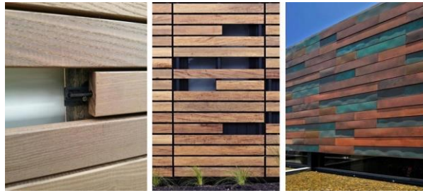
Figure 1. Accoya wood

It is made of cement fibers and is used in the facade of the building. Cement fiber is made of cellulose and mineral materials reinforced by a matrix, which has a smooth and opaque fog. The EQUITONE Moda is manufactured at a maximum panel of 125 by 310 cm and can be used comfortably in any shape or dimension and in modular form. EQUITONE cement fibers have eating, perforating, and eating ability. Fixing methods include rivets, screws, glue and invisible fittings on wooden or metal frames. Creative architects and designers use EQUITONE cement fibers in interior design. EQUITONE has a wide range of color spectra, which is also suitable for interior design projects.