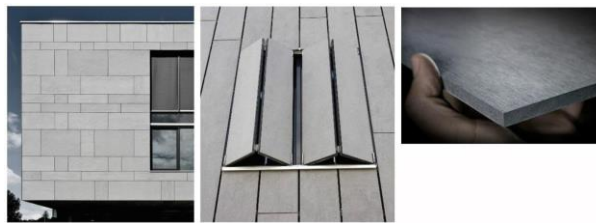
Figure 2. Cement fibers

It is made of cement fibers and is used in the facade of the building. Cement fiber is made of cellulose and mineral materials reinforced by a matrix, which has a smooth and opaque fog. The EQUITONE Moda is manufactured at a maximum panel of 125 by 310 cm and can be used comfortably in any shape or dimension and in modular form. EQUITONE cement fibers have eating, perforating, and eating ability. Fixing methods include rivets, screws, glue and invisible fittings on wooden or metal frames. Creative architects and designers use EQUITONE cement fibers in interior design. EQUITONE has a wide range of color spectra, which is also suitable for interior design projects.