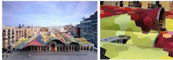
Figure 3. Shape shell composite

The advanced Shapeshel composite is nowadays widely used and increasingly used by architects (Figure 3). Take their imaginative projects. This unique material is used in the building's exterior as an external veneer panel, and can be used in commercial buildings as a focal point for creating a sense of inviting. Shapeshell is made with 3D CNC and is lightweight. It is resistant to chemical shock and chemical, and it is non-conductive. Another advantage of this material is its anti-flammability certificate in construction facades and full color rendering of this material.