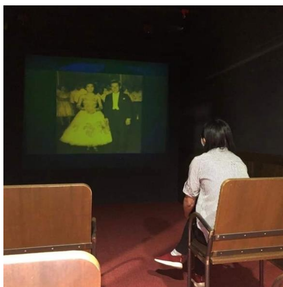
Figure 4. An interactive Cinema Room exhibition at Penang House of Music

Other fascinating interactives features at this sui generis museum is the digital Potehi display, Listening Chair which is been surrounded by sentimental and retro music, listening doom and all types of musical instruments for diverse genre and traditions. The exhibited features can be photographed, touched, and played with, for instance, Sompoton, Yue Qin, Saxophone, Ukulele, and many more. The environment of Penang House of Music makes it much easier for visitors to focus entirely on the works of art on display and appreciate more of their visits by displaying a wide range of musical instruments as exhibitions.