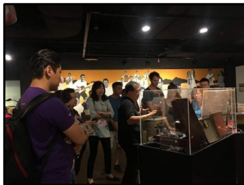
Figure 5. Visitors at the Penang House of Music attentively listening to the explanation by the curator.

In the Virtual Reality Area, Cinema Room, and Radio Room, where these exhibits are among the core attractions present in this museum, the visitors had shown faces of enjoyment, thrill, and amazement to experience each exhibition hall. In a broader term, visitors at Penang House of Music will visit on a massive scale on major holidays, school holidays, and local travel companies that include this museum as one of the places to visit in Penang in their calendars.