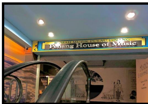
Figure 1. The main entrance of Penang House of Music