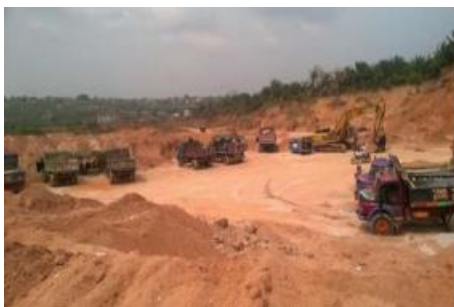
Figure 2. Oba Excavation Site (Photo shot by the researchers), date taken: 02/02/2017