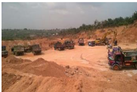
Figure 1. Oba Excavation Site, date taken: 02/02/2017