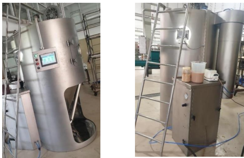
Figure 1. Image of the spray dryer