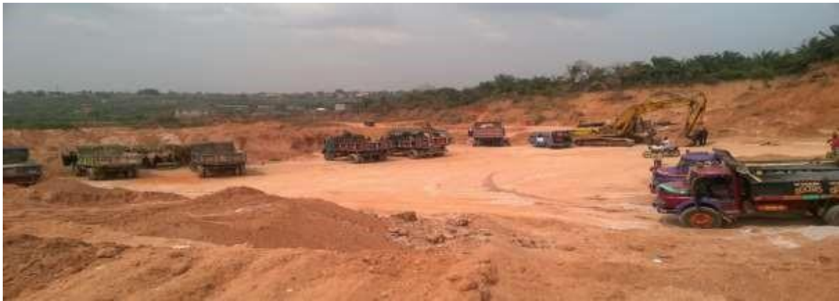
Figure 1. Oba Excavation Site, date taken: 02/02/2017

6.833°E ( https://en.m.wikipedia.org/wiki/Oba,_Anambra , Date Accessed, 14/11/2019)