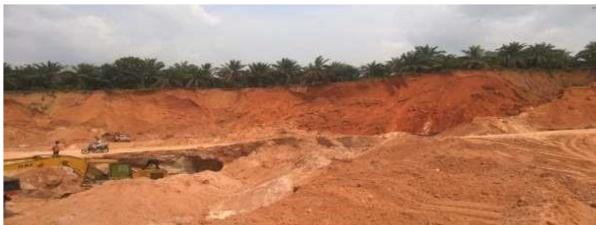
Figure 2. Oba Excavation Site (Photo shot by the researchers), date taken: 02/02/2017